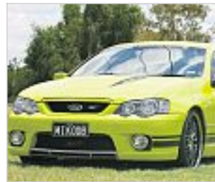
This mean machine is ready to hit the bitumen.