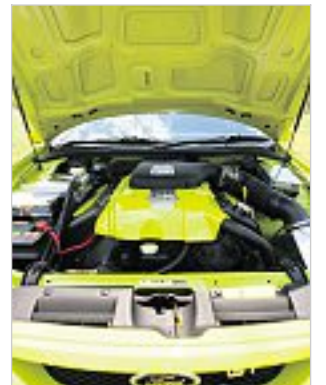
Check out the colour co-ordination under the bonnet.

I'd love a 1971 XY Phase 3 because they're just a great car and one I've always wanted.